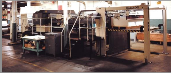
DFK Sheeter Operator friendly footprint

Designed to produce crisp, tight piles the stacker's jogging system is built to withstand continuous operation. An air delivery system introduces a cushion of air between each cut packet. Meanwhile a back jog plate and side jogger blades vibrate sheets into press ready skids.