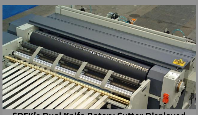
SDFK's Dual Knife Rotary Cutter Displayed

The MAXSON SDFK Sheeter provides a cost effective alternative to drop shear or guillotine cutters that limit production speeds on inline extruding and coating lines. It offers: